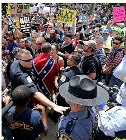
PHOTO: Young woman confronts KKK sympathizer amidst demonstrations.

"I agree, Newel, but geez that's still a depressing thing Isaiah said." "Yes it is, Freedom, but look at his last line. It paints a picture of a society whose institutions are cut down, leveled. And yet . . . and yet . . . stumps remain. Anyone who's ever cut down a tree knows that new growth sprouts from the stump.