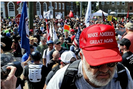
PHOTO: Alt-Right, KKK, Neo-Nationalists and their supporters march in Charlottesville, VA

Apparently, I was not the first to ask that question and its follow-up, "Give us a sign!" After the assault on freedom by the Alt-Right, Nazis, and the KKK in Charlottesville, and Trump's morally vacuous equating of those hate groups with those who came out to protest their message, I needed to consult with my go-to theologian, Father Newel Post. Newel leaned back in his chair and smiled ruefully. "Freedom, I don't blame you for wondering how long it will be before enough people in Congress find their conscience and remove Trump from office: either by impeachment or by exercising the 25 th amendment.